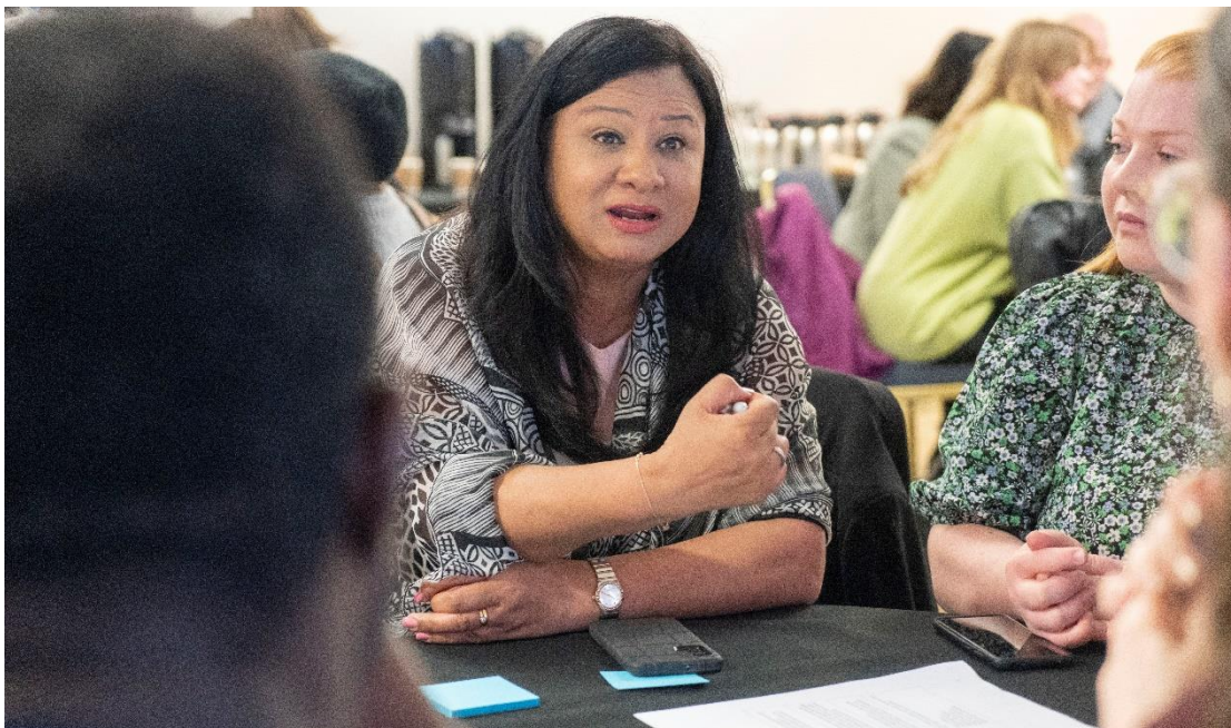
Workshop attendees have their say at John Smith's Stadium, Huddersfield