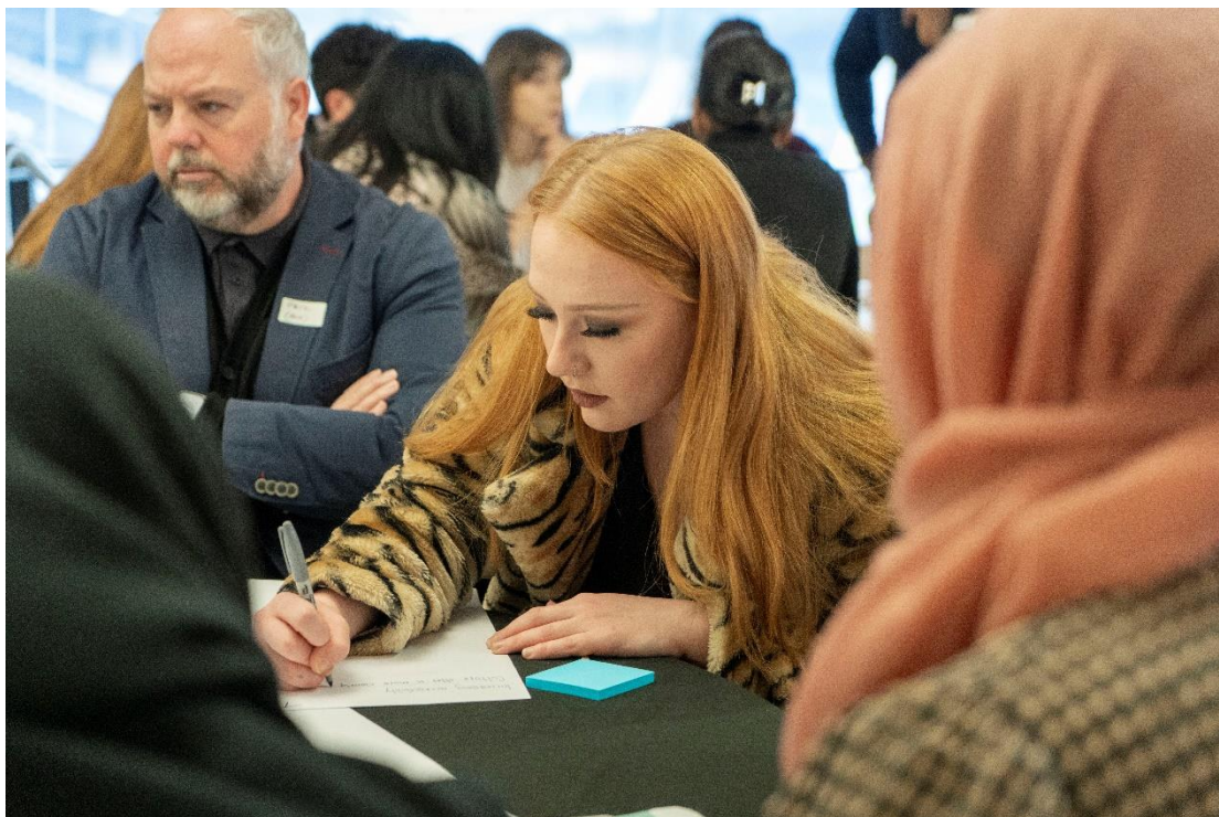
Taking notes at John Smith's Stadium, Huddersfield