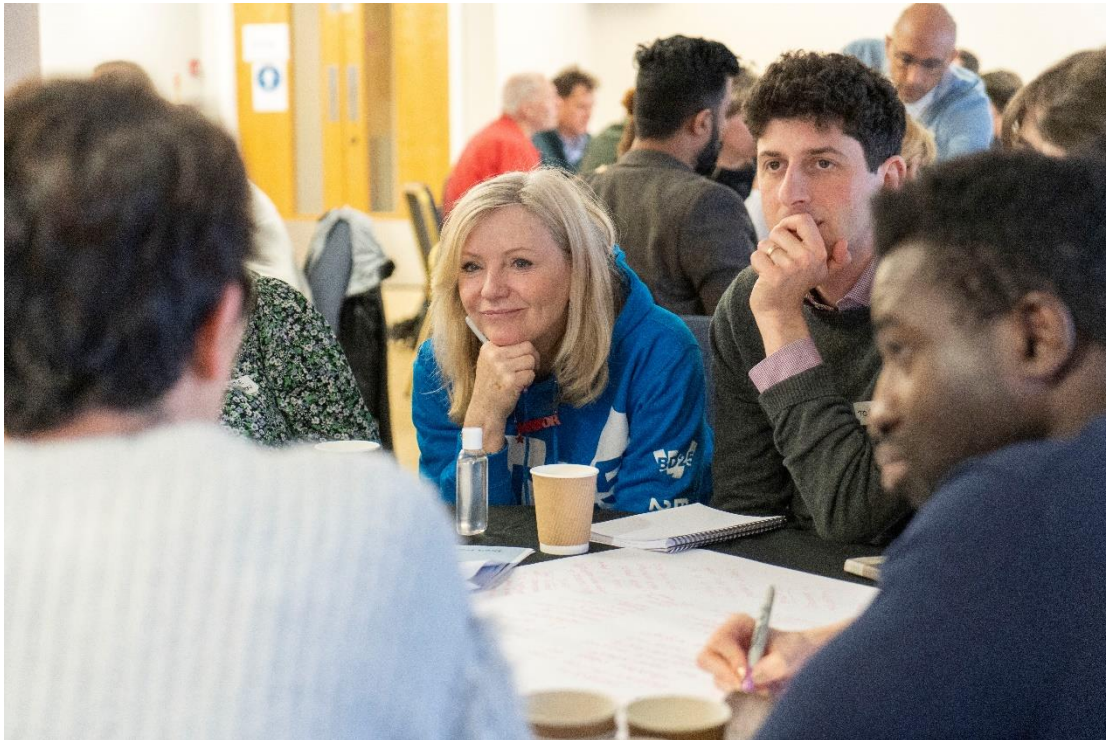
Mayor Tracy Brabin listens to feedback at John Smith's Stadium, Huddersfield