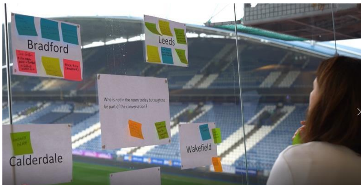
Who is not in the room, but should be?