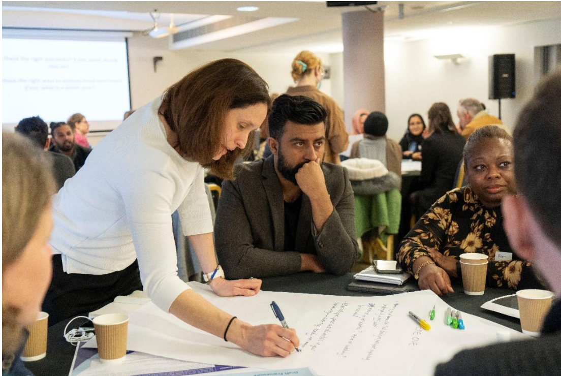
Taking notes at John Smith's Stadium, Huddersfield